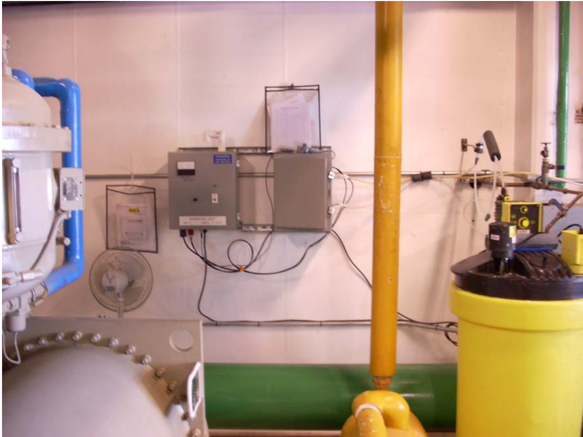
Former steel cell housing MiniBrom Model MB 5 installed in major hospital power house Yellow plastic dilution tank to the right

MiniBrom units are currently supplied with Grundfos chemical pumps and 16 feet of 0.375 PE tubing to route the produced bromine solution to the feed point.